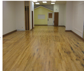
The floor after it was scraped, sanded, and covered in three coats of poly.

gave me the tools I needed to get to where I am today . . . weeks away from opening my bookstore!!